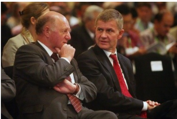
Forestry talk: Norway's Environment and International Development Minister Erik Solheim (right) talks to the United Kingdom's Minister of State at the Department for the Environment, Food and Rural Affairs, Jim Paice, during the Forests Indonesia Conference in Jakarta on Tuesday.

Indonesia has sealed a notable agreement with the Norwegian government, which has promised to pay US$1 billion in assistance funds in 2014 should Indonesia be successful in reducing levels of deforestation and greenhouse gas emissions.