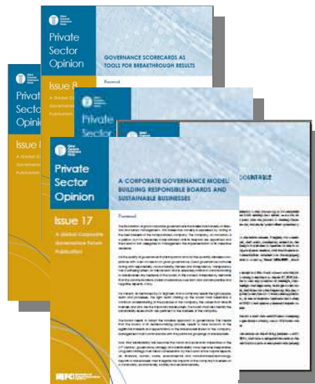
PSO Issue 17

A Corporate Governance Model: Building Responsible Boards and Sustainable Business